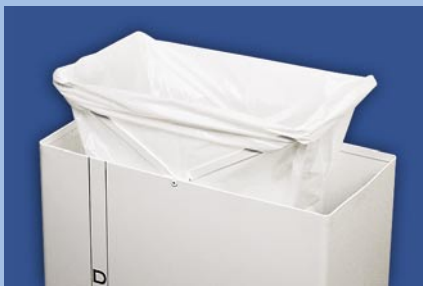
Fold top of bag over edges of bail to secure.