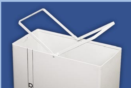
Lift bail mechanism and drop in bag.

INTERNAL BAIL MECHANISM SECURES DISPOSABLE BAGS - Bag securing mechanism comes on all wall mount models.