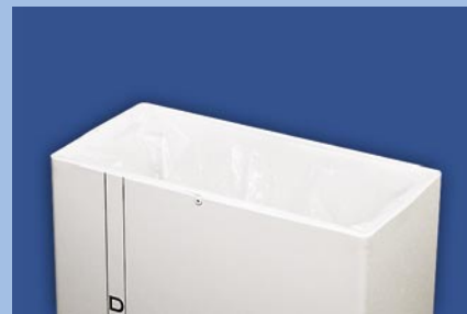
Press bail mechanism back into place.